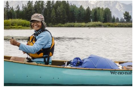
Kit Williams - Tripmaster