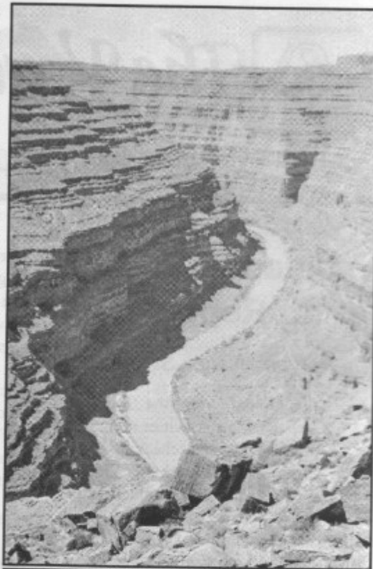
San Juan River Canyon from Top of Honaker Trail

Our last group hike was at Slickhorn Gulch. The pools along the canyon were filled with clear and mystical water. None in the group had ever seen so much water in this canyon. My favorite part of this gulch was the drill holes left by the many small pebbles caught for thousands of years in the tiny holes in the rock the pebbles were drilling. At one point, there was a large pool with a long but gentle waterfall on the far side. As other members of the group hiked onwards and deeper into gulch, I stayed behind for a solitary swim across the pool to be under the waterfall. What a peaceful delight. It was a wonderful trip for all of us who were able to paddle!