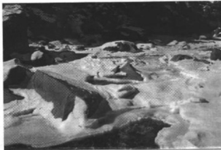
Arkansas River, Frog Rock rapid in winter ice.

But you never run the Arkansas, you say? Why does it matter to you? Because our sport, paddling, is growing in popularity. Privately and commercially, both residents and tourists love taking to the water. Colorado's human population is growing rapidly. People who can't get permits for the Ark will paddle someplace else. What's next, the Poudre? Horsethief/Ruby? Lower Gunnison? What's your favorite run? There's a land manager out there eyeing it, guaranteed. What happens here will influ-