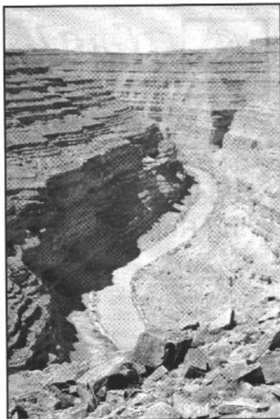
San Juan River Canyon from Top of Homaker Trail

Our last group hike was at Slickhorn Gulch. The pools along the canyon were filled with clear and mystical water. None in the group had ever seen so much water in this canyon. My favorite part of this gulch was the drill holes left by the many small pebbles caught for thousands of years in the tiny holes in the rock the pebbles were drilling. At one point, there was a large pool with a long but gentle waterfall on the far side. As other members of the group hiked onwards and deeper into gulch, I stayed behind for a solitary swim across the pool to be under the waterfall. What a peaceful delight. It was a wonderful trip for all of us who were able to paddle!