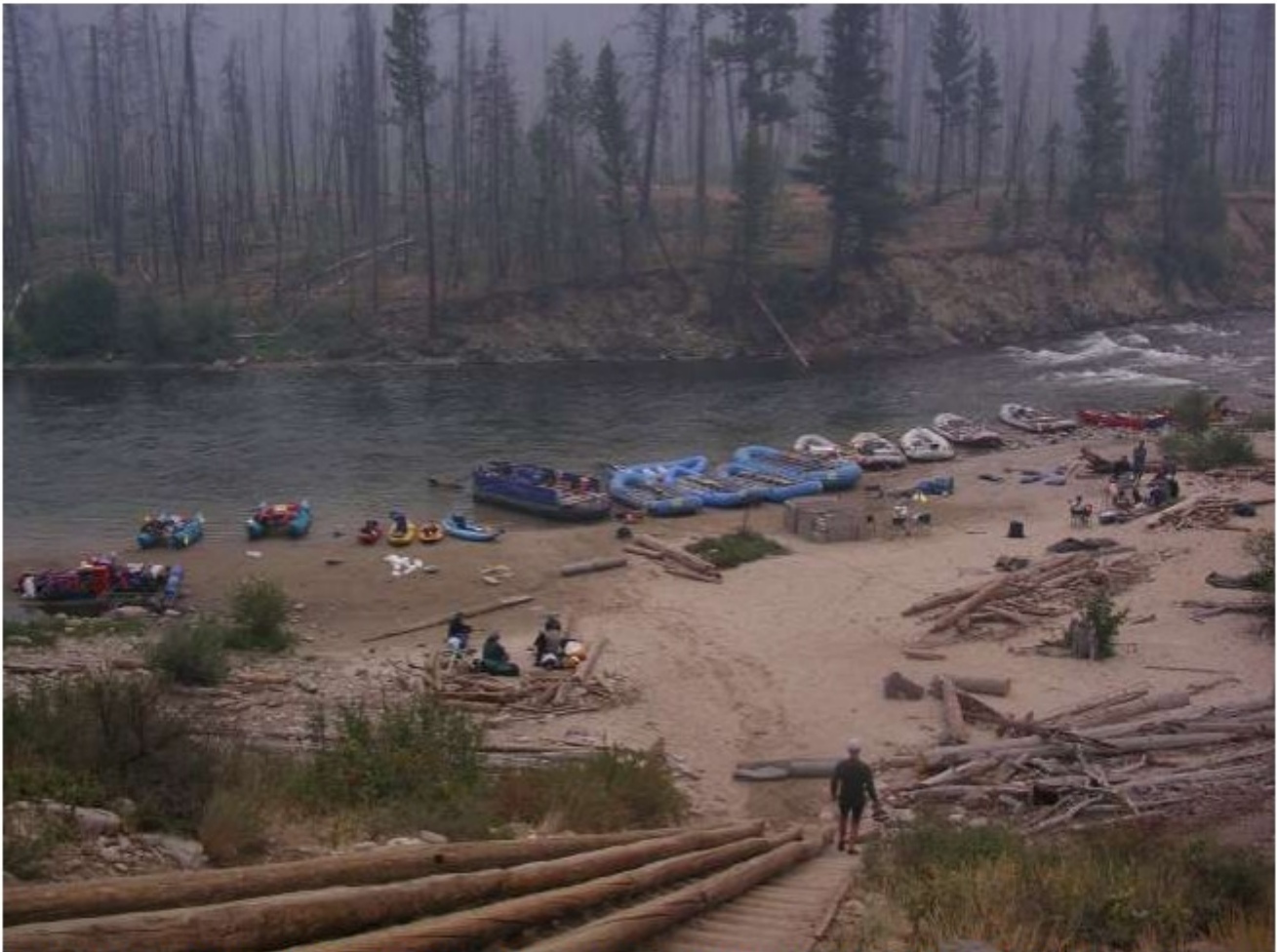
The Indian Creek beach from l to r a pile of boats & gear to be flown out, the PDG's on the river at the same time ( they used our planes to fly out), 2 groups of commercials with a sweep boat, in front the stacked river boxes,

Up at the airstrip there were piles of gear every where. The planes were arriving within minutes of each other, then loading the gear and passengers. On takeoff they were flying out to disappear in the smoke in less than a mile of the strip. When the planes were on the ground a lot of scheduling and load management (will it fit??) was taking place with the pilots. We got quotes of about $2000 to haul our gear, boats, and ourselves out to Stanley, ID. There we hoped to get with our shuttle company to not shuttle our cars to the takeout.